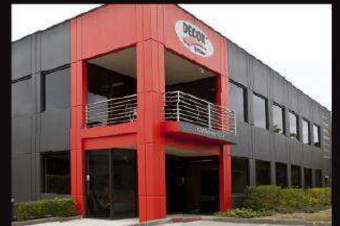
The home of Decor Systems Australia.

DECOR SYSTEMS UK 178 Cheddon Road Taunton TA2 7AN United Kingdom